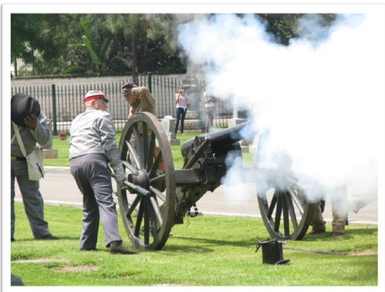
The Canon Salute at Santa Ana Cemetery